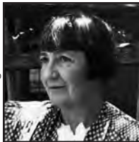
Mabel Dodge Luhan